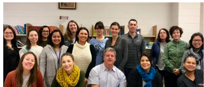
Dual Language Committee